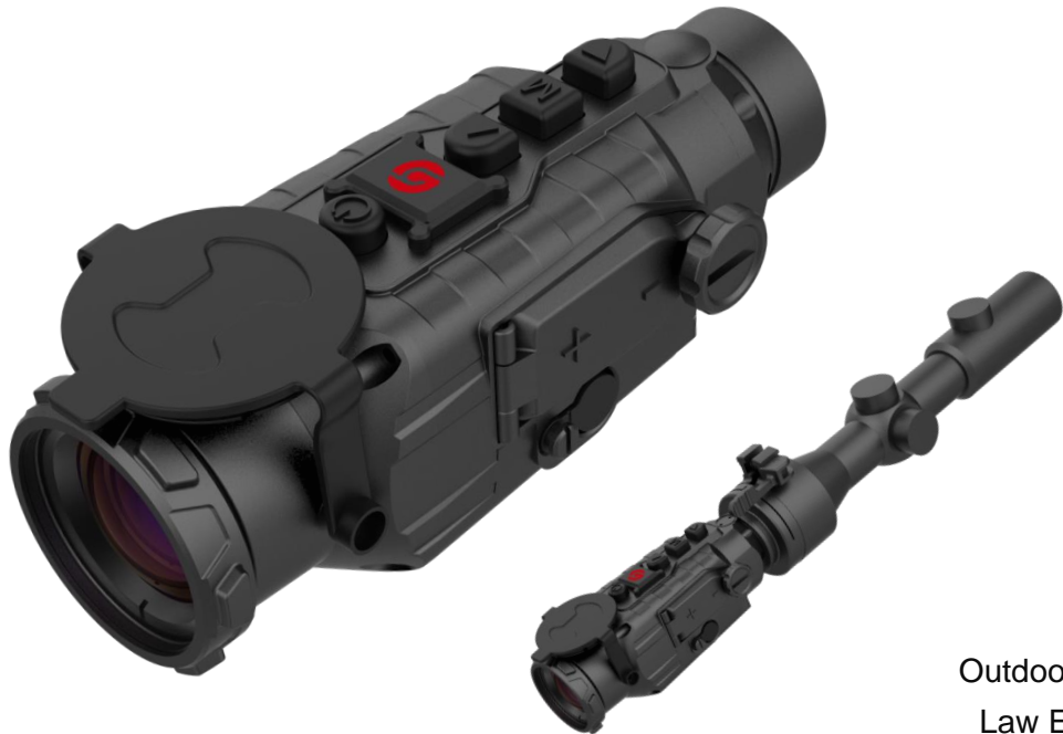
Outdoor Observing Law Enforcement

TA435 helps to transform optic sight into a night vision sight, no re-zeroing required, easy to use, excellent imaging, compact and lightweight, durable, suitable to various environments.